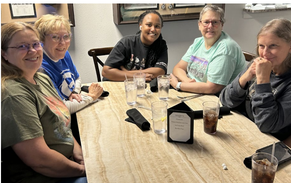
One of our many Dinner Groups met last week at Guthrie Grill