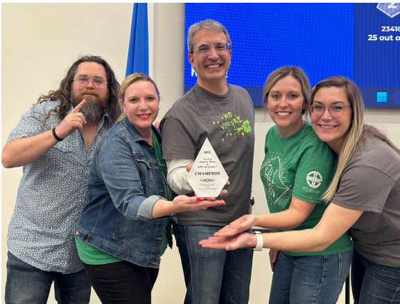
Team "FCC All In" won the 2 nd annual "Are You Smarter Than A GPS 5 th Grader?" Guthrie Educational Foundation Fundraiser last week!