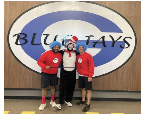
The Cat in the Hat made his rounds at Mother's Day Out and in our local Schools last week to celebrate Sues week!