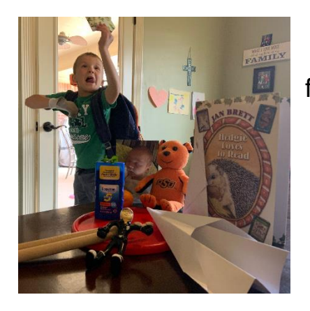
Thank you to everyone who participated!