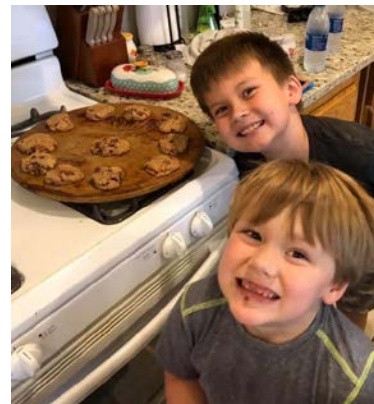
ETHAN & HENRY COTTON Peanut Butter Chocolate Chip Cookies