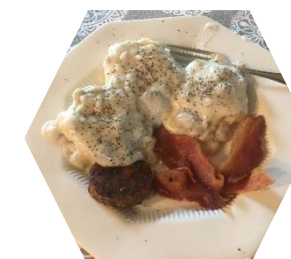
JANIE CAREY Breakfast