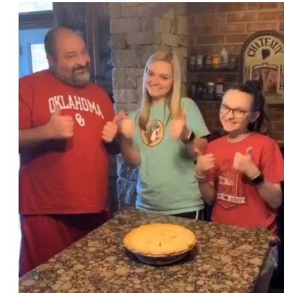
ROSS FAMILY Apple Pie