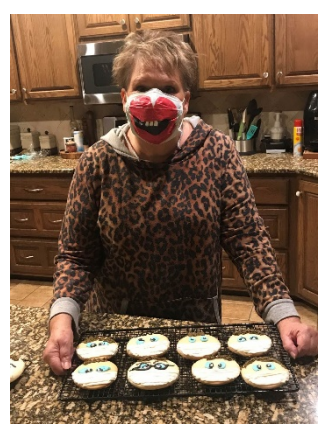
PAM WILLIAMS Butter Cookies