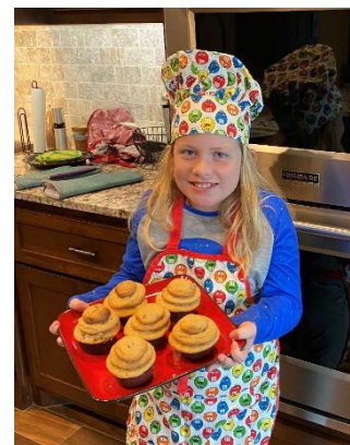
GABBY BENCH Chocolate Brownie Chocolate Chip Cupcake