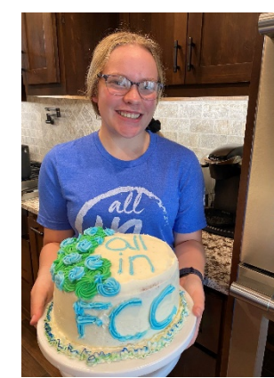
MAKENNA BENCH Double Layered Vanilla Cake with Homemade Icing