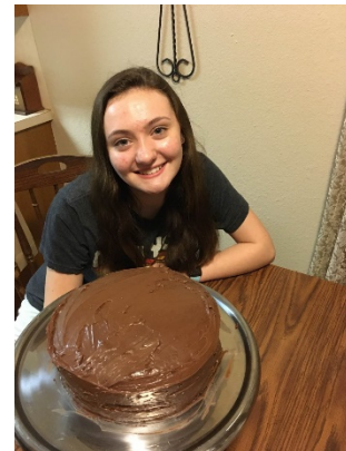
BELLA BENHAM Chocolate Fudge Cake