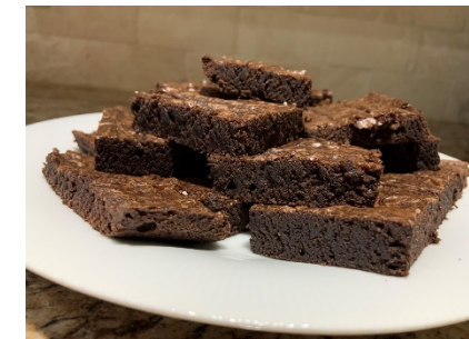
SIMPSON FAMILY Brownies