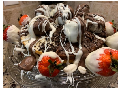
ALLEN FAMILY Strawberry/Oreo Cake