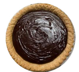
MARLA BELCHER Chocolate Fudge Meringue Pie