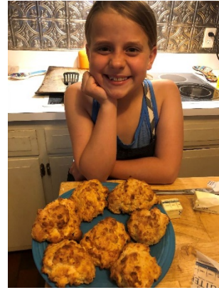
BAILEY HARDIN Old Bay Cheesy Biscuits