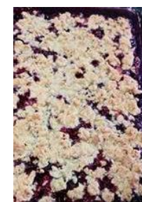
TERRYL WIECZOREK Blackberry Cobbler